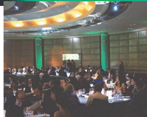
The Jade Moon Ballroom

The ACMAV tradition for a blockbuster Ball has continued in style with the 2014 Charity Ball. This year's event was held at the Park Hyatt Melbourne, on September 6th . The objective was to support the Jade Ribbon Hepatitis B Campaign in the ongoing pursuit to raise the profile of this silent but deadly disease. The ballroom was lit up in a grand shade of green in line with the jade theme. The evening was MC'd by radio and television personality Mr Derryn Hinch, whose own brush with liver disease is well known. As Victoria has been the nation's launch pad for the Hepatitis B Jade Ribbon Campaign , it was only fitting to have the Health Minister for Victoria, the Honorable David Davis, as the lead speaker for the evening. This was