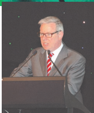
The Hon David Davis