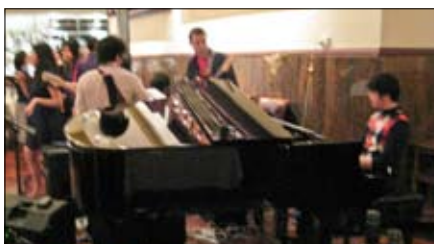
Apollo Music Society members tune up to play at the ACMAV Conference Dinner