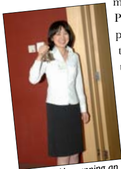
"It's just like running an OSCE exam!"