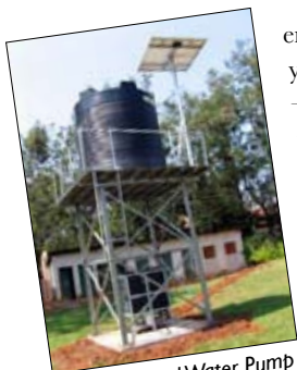
Solar-Powered Water Pump in Uganda