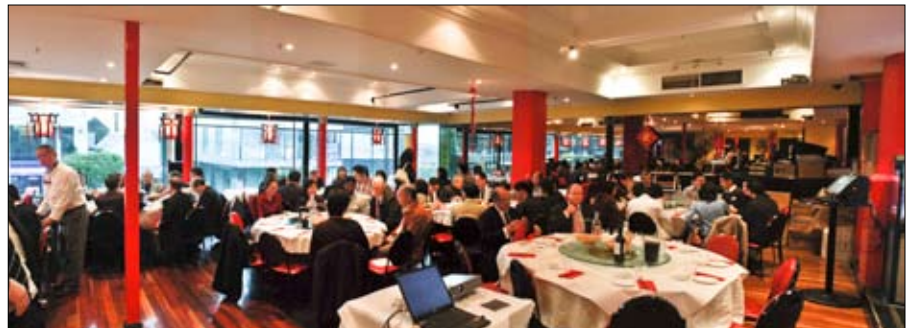
Tooraking Restaurant was the venue for our October Seminar on Hirsutism.