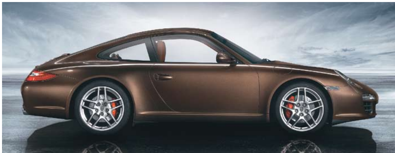
Model shown is the new 911 Carrera S.