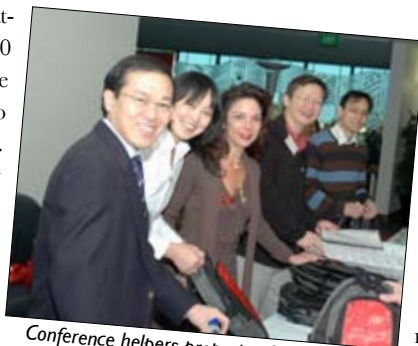
Conference helpers preparing for the crowd.